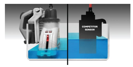
Minimum Trigger Depth is 3/8"