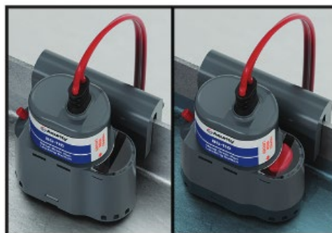
Latches When Triggered. Manual Reset