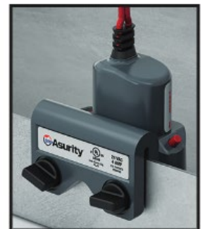
Secure with Thumb Screws